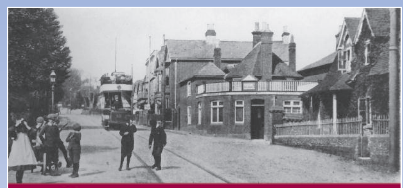
The Portsdown & Horndean Light Railway