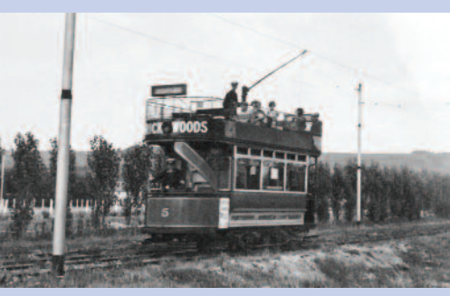
The tram conductor and driver look towards the camera when heading for Southsea.