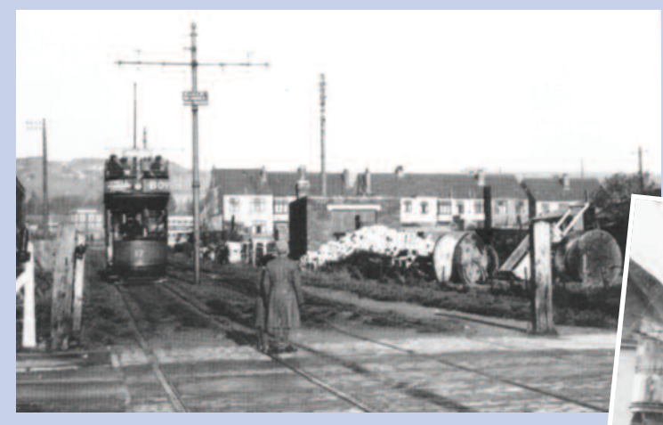
Where the tram is going away from camera is where Cosham fire station is now located. Below: This is the same scene at Waite Street crossing today.