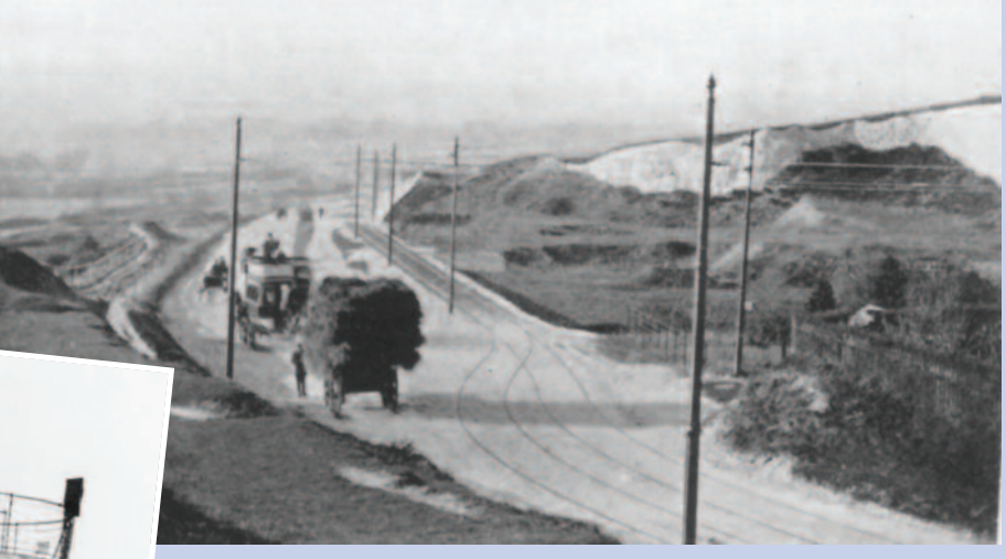
Quite recognisable even today. We are looking down the London Road from the top of Portsdown Hill. It is 1903 and the tram tracks for the line to Horndean have been laid but are not yet in service. Going downhill can be seen a horse-drawn bus followed by a loaded haywain.

Below: The Heroes of Waterloo on the right with the Baptist church on the other side of Hambledon Road.